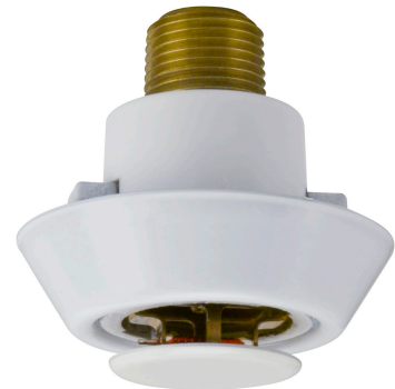
RESIDENTIAL FLUSH PENDENT WITH DROP ESCUTCHEON