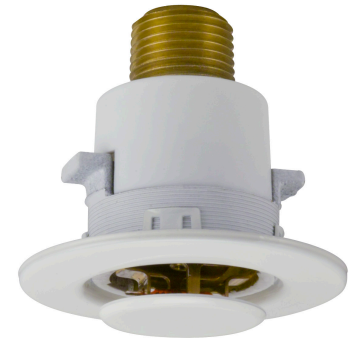
RESIDENTIAL FLUSH PENDENT

The heart of Globe's Millennium™ Sprinkler actuating assembly is a hermetically sealed frangible glass ampule that contains a precisely measured amount of fluid. When heat is absorbed, the liquid within the bulb expands increasing the internal pressure. At the prescribed temperature, when the internal pressure exceeds the strength of the glass ampule, the ampule ruptures. The levers that had been held in position by the bulb now collapse inward allowing the deflector and Teflon coated belleville washer seal to move downward to the full-operating position. This results in water discharge that is distributed in an approved pattern.